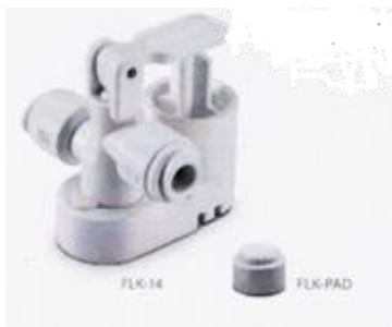
Part number FLK-14

This is how the RO leak protection device appears