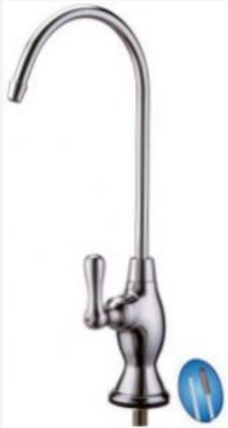
905 Series Faucets