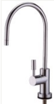
888 Series Faucets