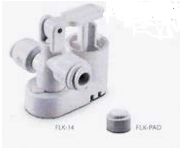
Part number FLK-14