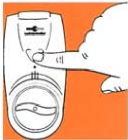
Smart Shut-off Valve